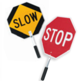
SIGNS + MORE